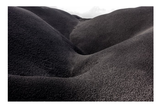
Susannah Hays Untitled No. 1 (1/10), 2023 Archival Pigment Print on Kozo Paper 24 x 36 in UNFRAMED PRINT USD$1900