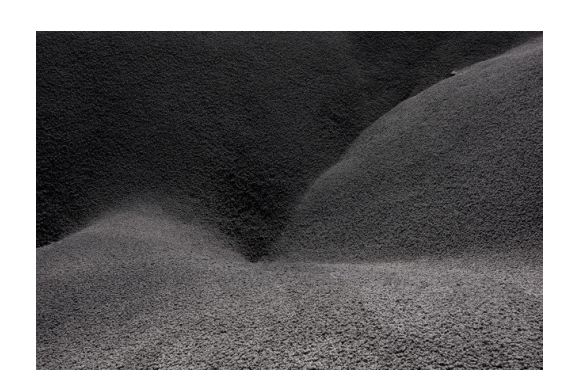
Susannah Hays Untitled No. 2 (2/20), 2023 Archival pigment print on Kozo 23.50 x 31.50 in UNFRAMED PRINT USD$1400