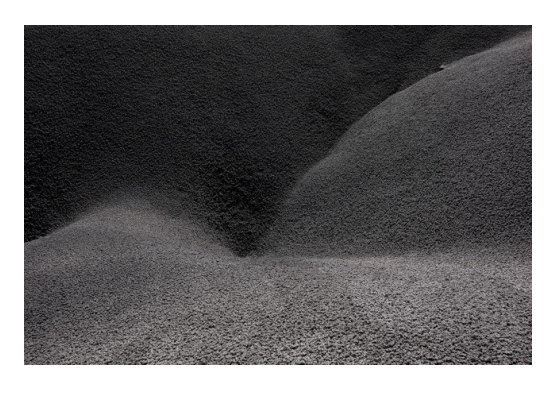
Susannah Hays Untitled No. 2, 2023 Archival Pigment Print on Kozo Paper 24 x 36 in UNFRAMED PRINT USD$1900