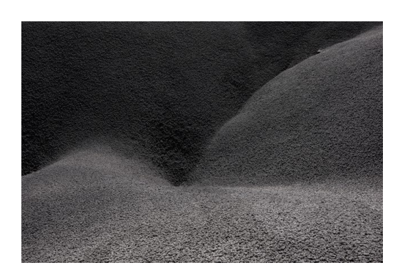
Susannah Hays Untitled No. 2 (1/20), 2023 Archival pigment print on Kozo 25.50 x 33.50 in Framed 23.50 x 31.50 in Framed Print USD$2000

4071 24th street San Francisco, CA 94114 (415) 795-1643 chung24gallery.com