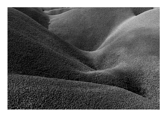
Susannah Hays Untitled No. 3 (1/20), 2023 Archival pigment print on Kozo 25.50 x 33.50 in Framed 23.50 x 31.50 in FRAMED PRINT USD$2000