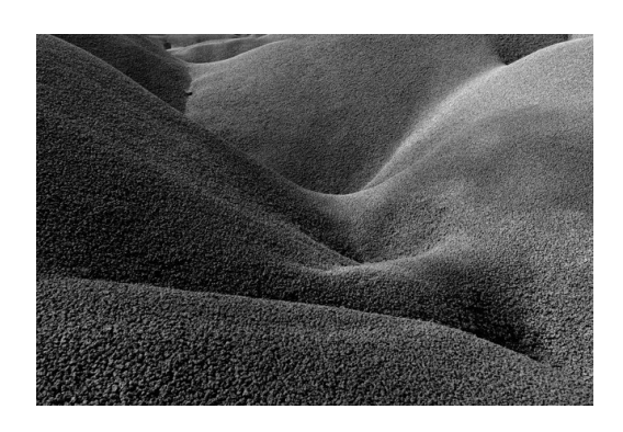
Susannah Hays Untitled No. 3 (2/20), 2023 Archival pigment print on Kozo 23.50 x 31.50 in UNFRAMED PRINT USD$1400

4071 24th street San Francisco, CA 94114 (415) 795-1643 chung24gallery.com