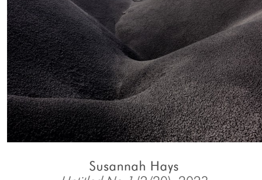
Susannah Hays Untitled No. 1 (2/20), 2023 Archival pigment print on Kozo 23.50 x 31.50 in UNFRAMED PRINT USD$1400