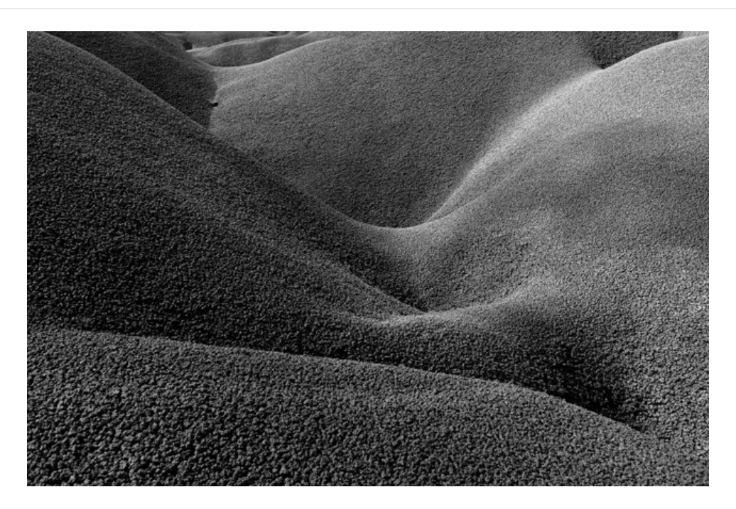
Susannah Hays Untitled No. 3 (1/10), 2023 Archival Pigment Print on Kozo Paper 24 x 36 in UNFRAMED PRINT USD$1900

4071 24th street San Francisco, CA 94114 (415) 795-1643 chung24gallery.com