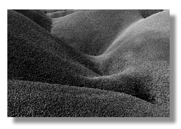
Untitled No. 1/2023

As above, so below, the soulful action of solar light touches Permian depths.