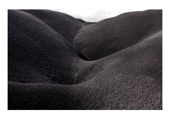
Susannah Hays Untitled No. 1 (1/20), 2023 Archival pigment print on Kozo 25.50 x 33.50 in Framed 23.50 x 31.50 in FRAMED PRINT USD$2000